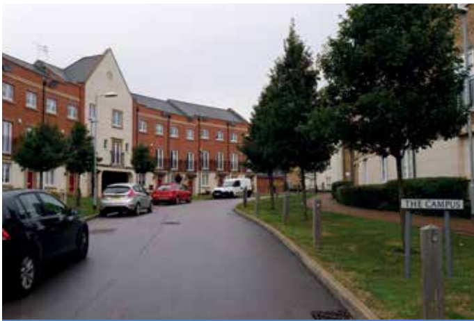
High Quality Homes