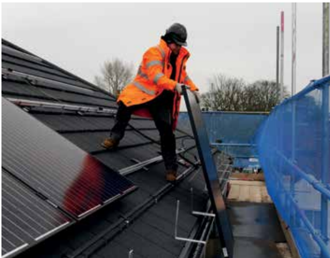
Sustainable energy solar panels