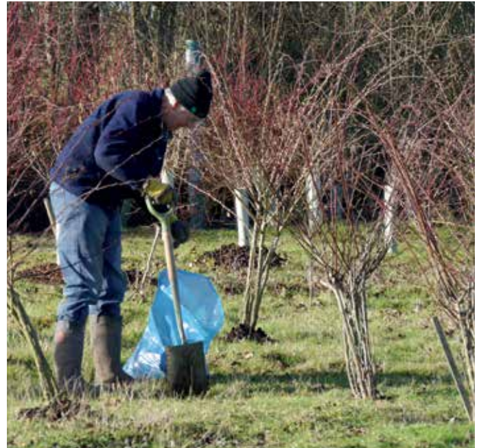
Countrycare volunteers at Bobbingworth