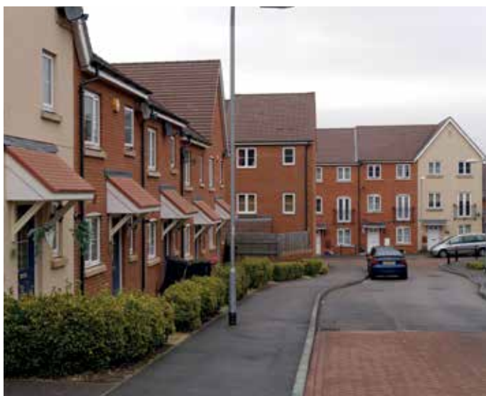
High Quality Homes

4.161 The majority of the development coming forward over the Plan period will be residential in nature. A core principle of planning is to always seek to secure high quality design and a good standard of amenity for all existing and future occupants of land and buildings. National policy expects a high quality of design that meets the needs of the diversity of people i.e. is 'inclusive'. It notes that design policies should concentrate on guiding the overall scale, density, massing, height, landscape, layout materials and access of new development in relation to neighbouring buildings and the local area. The consideration of design goes beyond appearance, and should address the connections between people and places, creating safe and accessible environments.