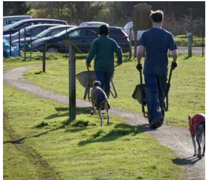
Countrycare volunteers at Bobbingworth