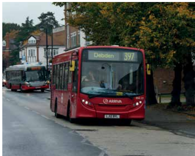
Local bus service