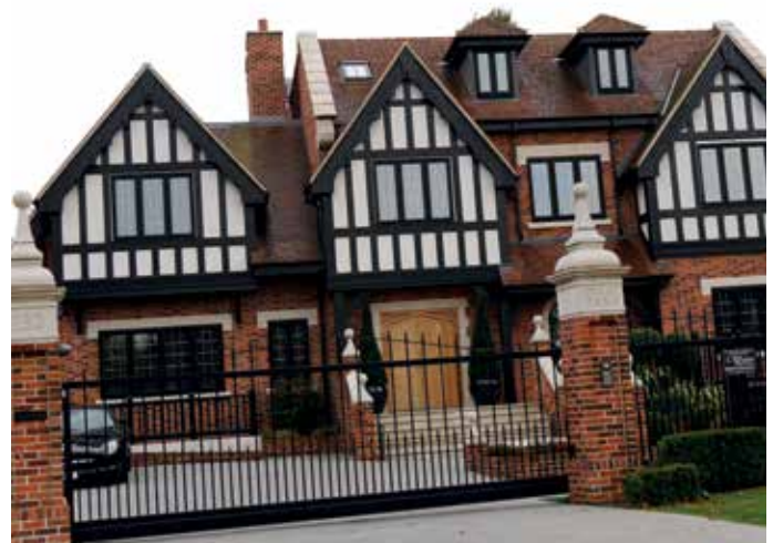
High Quality Homes

4.164 The design of the development impacts significantly on living conditions for occupiers and in particular the size and design of internal and external space are important. An analysis of recent applications for development highlights that there is pressure in the District for accommodation to be approved that does not meet the national space standards. There is therefore a need to ensure that all development meets at least the minimum space standards. The Council expects that opportunities are taken to improve the external environment of residential developments where existing quality is poor and to provide suitable public open space with developments, as appropriate, refer to DM 6.