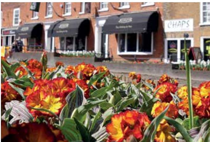
Fire Dragons (Polyanthus) in Epping