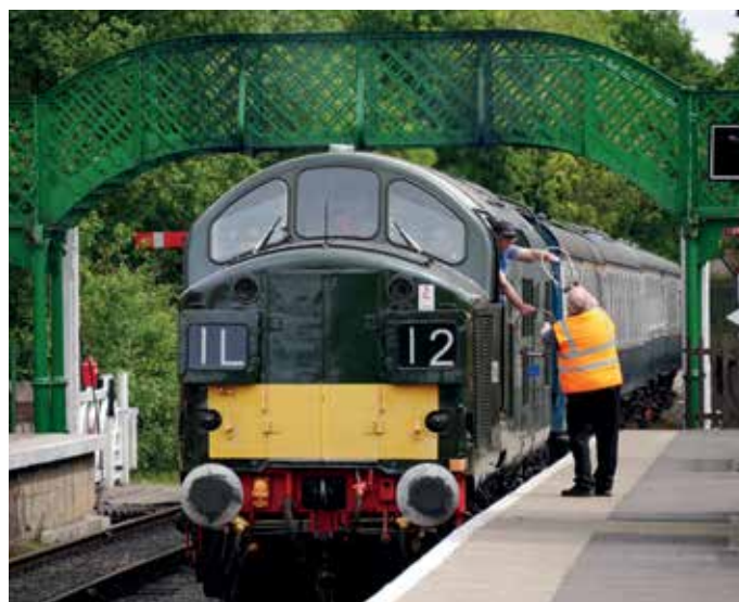
Tourism on the Epping Ongar Railway