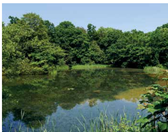
A local pond