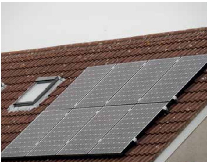
Sustainable energy solar panels

B. Where new national standards exceed those set out above, the national standards will take precedence.