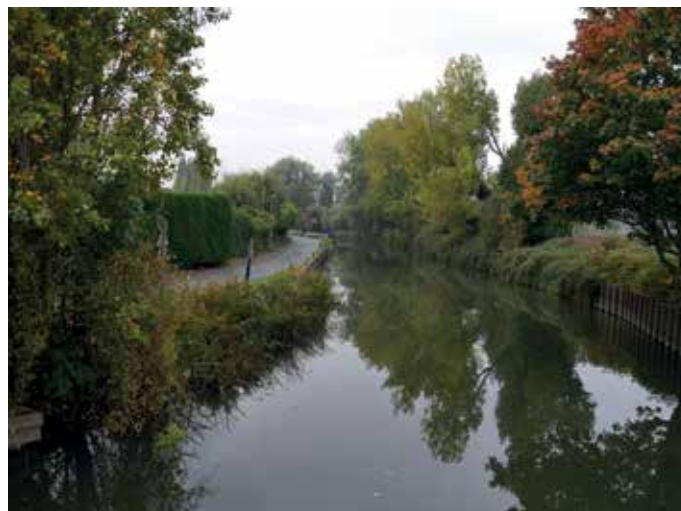
River Stort at Roydon