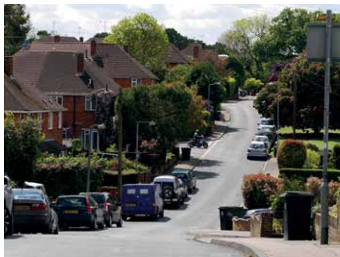
Streetscene in Epping Forest District

* Footnote: Where a 1 bedroom (1 person bed space) has a shower room instead of a bathroom, the floor area may be reduced from 39m 2 to 37m 2 , as shown bracketed.